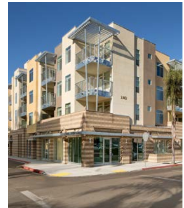
Lofts On Landis