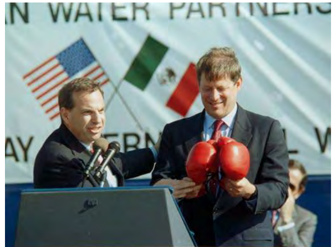
Rep. Bob Filner gave red boxing gloves to Vice-President Al Gore at the the IBWC plant dedication July 16, 1994, to thank the vice president for "delivering a knockout blow to Tijuana sewage in this river valley."

93 - International Treatment Plant was constructed by the International Boundary and Water Commission in 1997. After the failure of the dissipator pools to stop the sewage flow in the floods of 1980 and 1982, the city's O'Leary Report of 1983 recommended the construction of the treatment plant and ocean outfall pipe. Construction of the 75-acre treatment plant began in 1994 with a groundbreaking ceremony July 15 featuring Vice-President Al Gore. Construction of the plant was finished in April, 1997, and the ocean outfall pipeline was finished in Jan. 1999.