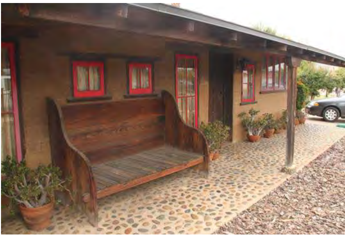
Palmer adobe on Beverley Ave dates from the Whitely Ranch.