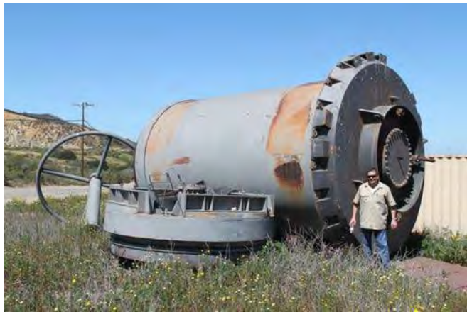
Rolf Lee stands next to the riser plug discarded when the Ocean Outfall pipeline was completed in 1999.

the 190 ft. drop shaft that connects the South Bay Land Outfall pipeline from the treatment plant to the Seabed Pipeline three miles offshore.