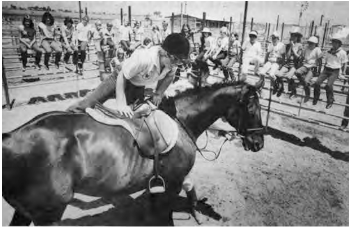
Girl Scouts at the Double WW Ranch ( IB Star Sep. 2, 1984).