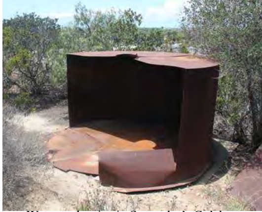
Water tank ruins in Smuggler's Gulch.

James E. Wadham, became an attorney and was elected mayor of San Diego 1911-13.