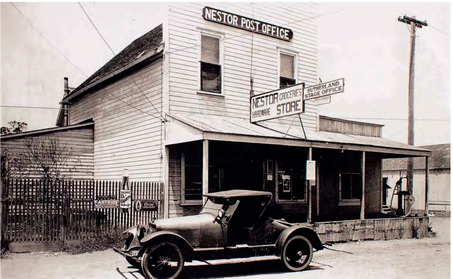
The building of the Nestor store and post office is still located at Hollister and Coronado.

30 - Palm City was a station of the National City & Otay railroad in 1887 and on the San Diego & Arizona Railroad in 1910. It was an important junction of County Road No. 1 (Hollister Street after 1957) that ran south to the border, and Palm Avenue that became state highway 75 to