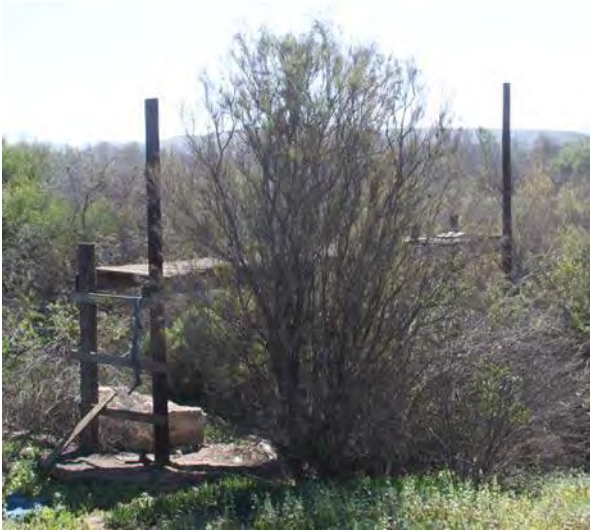
Ruins of the 1936 Cal Water plant in Bird & Butterfly Garden.

67 - The Dick Brown ranch at 2336 Hollister Street was located across the road from the water treatment plant in 1965.