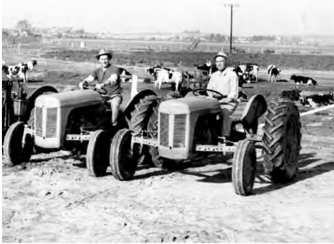
Louis Shelton (r.) and Willy Layton in 1951 (photo courtesy of Donna Shelton).

to Dairy Mart Road and farmed until the International Treatment Plant was built.