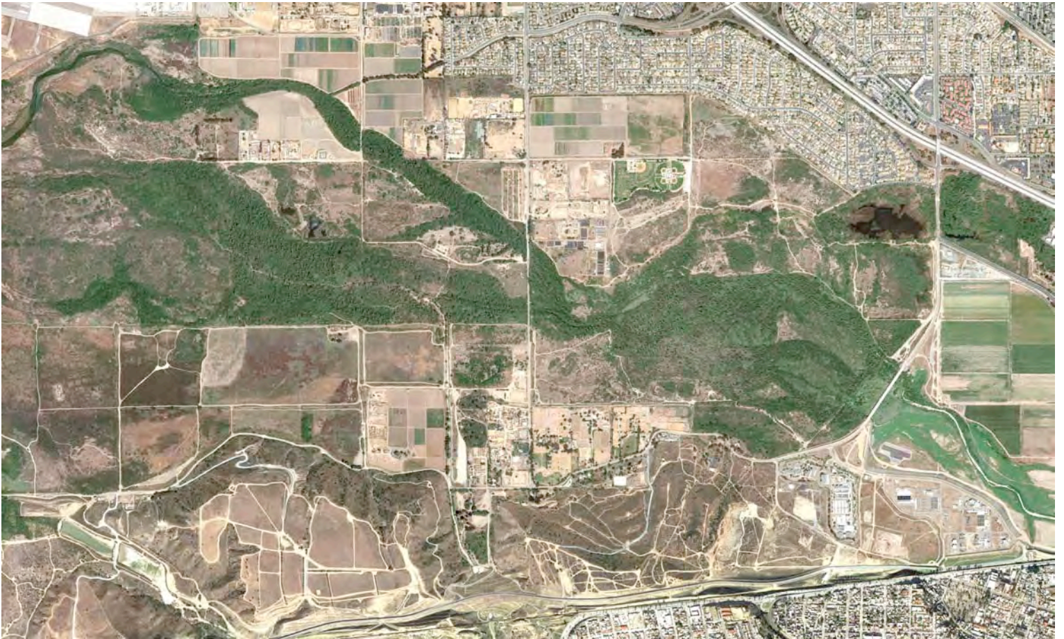
The top view shows the patchwork of the many farms and ranches in the valley in 1966. In the 2015 view below, the regional park has returned most of the river bottom land to a natural state, and suburbia is encroaching from the north.