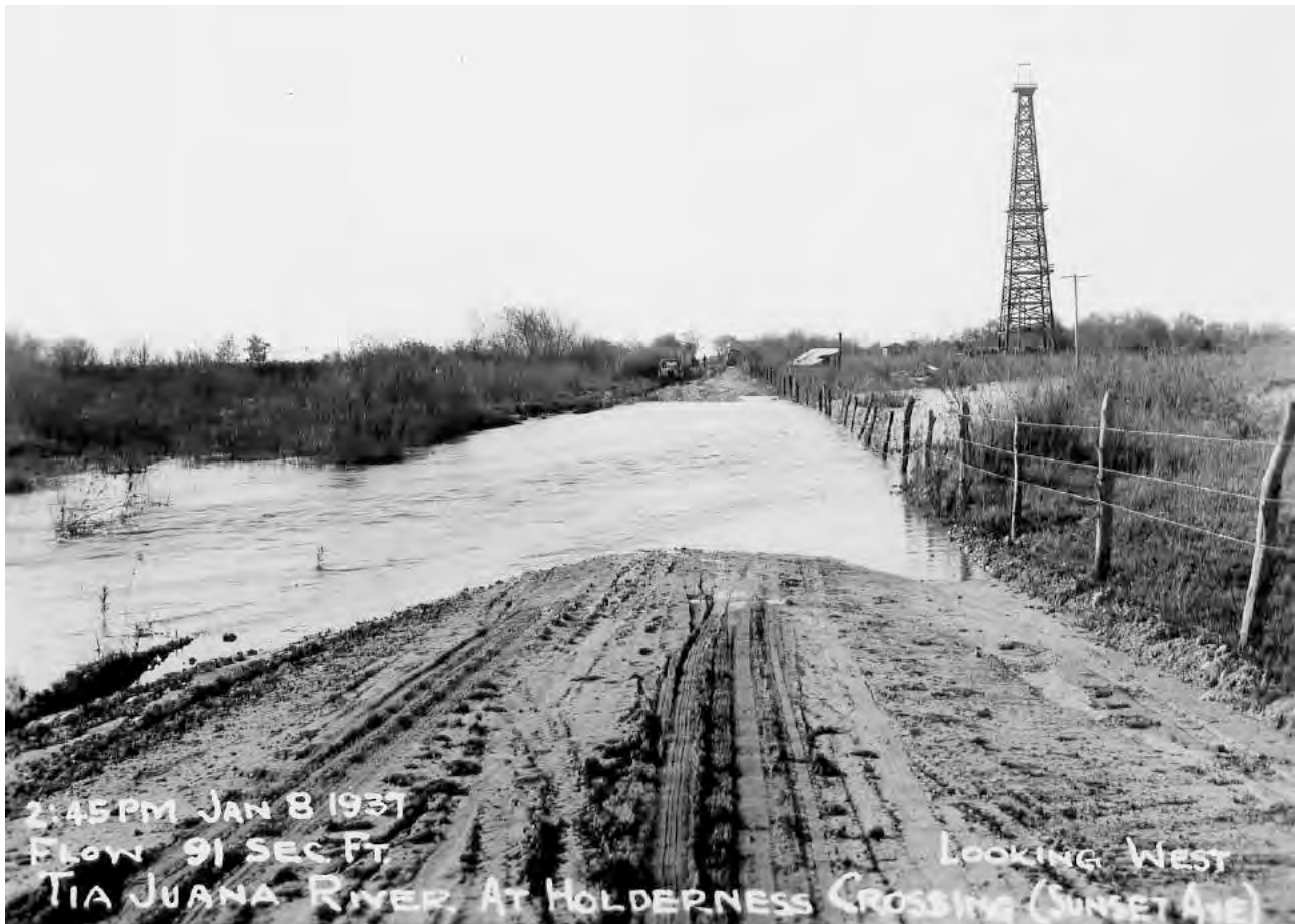
Sunset Avenue was unpaved and frequently flooded (1937 photo from the Sweetwater Authority).

10 - The Abner Whitely ranch of 160 acres was located on the north side of Oneonta and eventually was absorbed into the suburbs of Imperial Beach. However, two adobe homes survive today from the Whitely ranch, one owned by Dick and Jackie Palmer on Beverley Avenue, and one by Brian Bilbray on 9th Street. Oneonta Elementary School was opened in 1960.