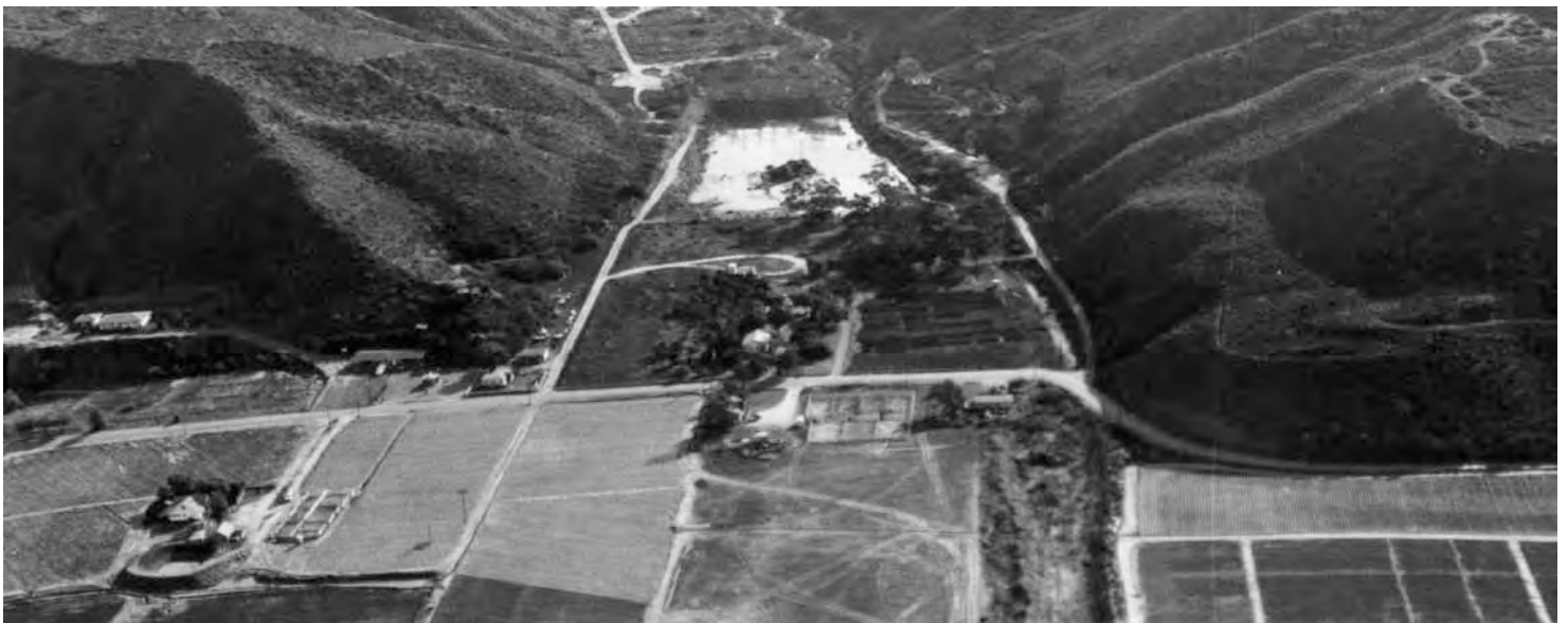
A large pool of water in the center of Smuggler's Gulch in 1966 was caused by the excavations of Conrock for sand and gravel. Jim Martin's ranch is at lower left (Photo courtesy of IWBC).

111 - The gate to Border Field State park was erected soon after the dedication in 1971 and a concession company was hired to collect the $1 per car admission fee. In 2014, a public art project was installed on the fence, known as the "The Border Field Gateway to Nature Communitree." Volunteers collected objects from the valley to be embedded in the display that represents the Park's native Elderberry Tree. Next to the gate is the Ocean Outfall Anti-Intrusion structure with large cement cap on top of