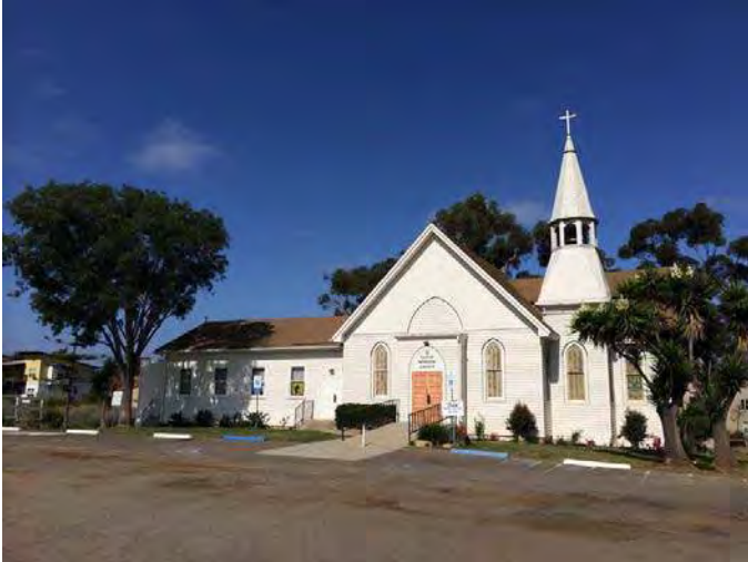
Nestor Methodist Church was built in 1896.