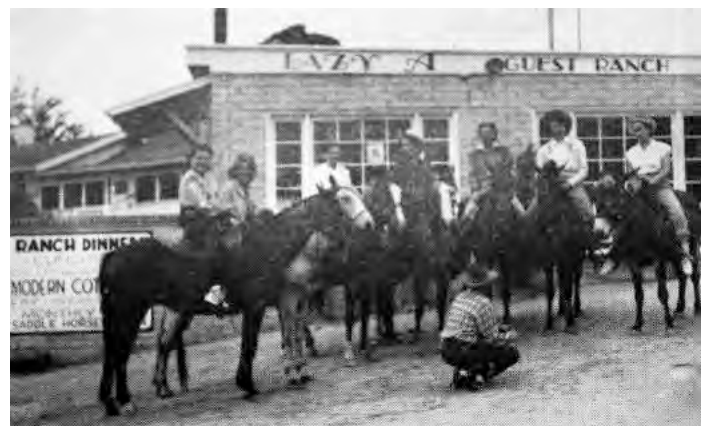
Lazy A Guest Ranch photo in 1950 Imperial Beach brochure.