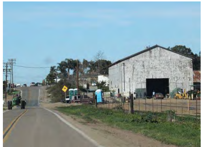
The Egger farm and barn on 19th Street.