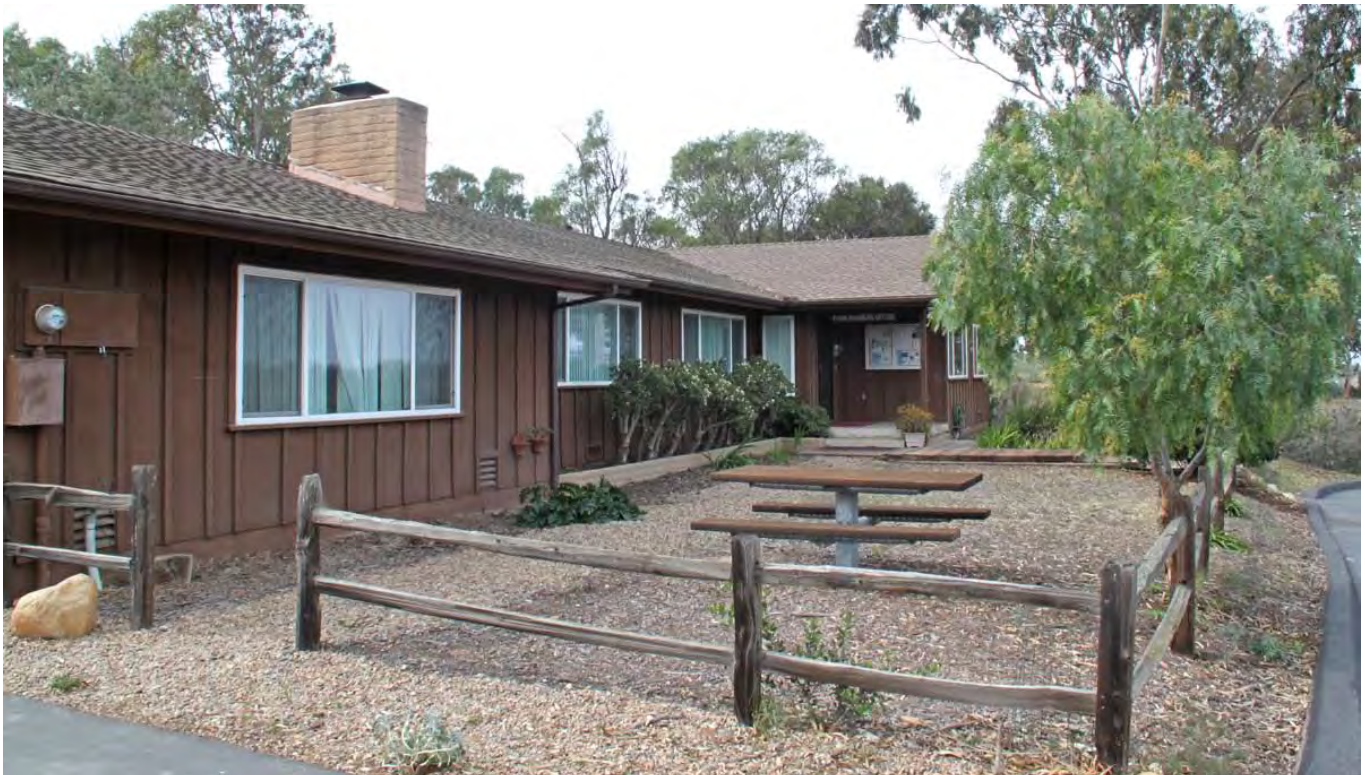
Shelton Ranch house built in 1970, now park ranger headquarters.