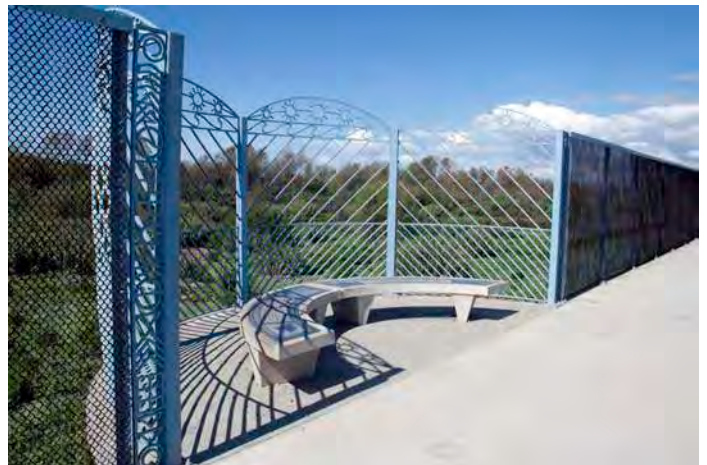
Public art on the Dairy Mart Bridge dedicated 1999.