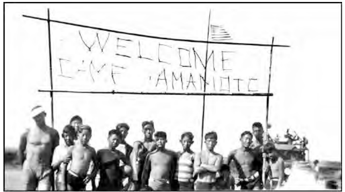
Camp Yamamoto was the first summer camp of Boy Scout Troop 52 in the Tijuana Slough in August, 1933.

61 - The Community Garden is located on county property in the flood plain of the Tijuana River.