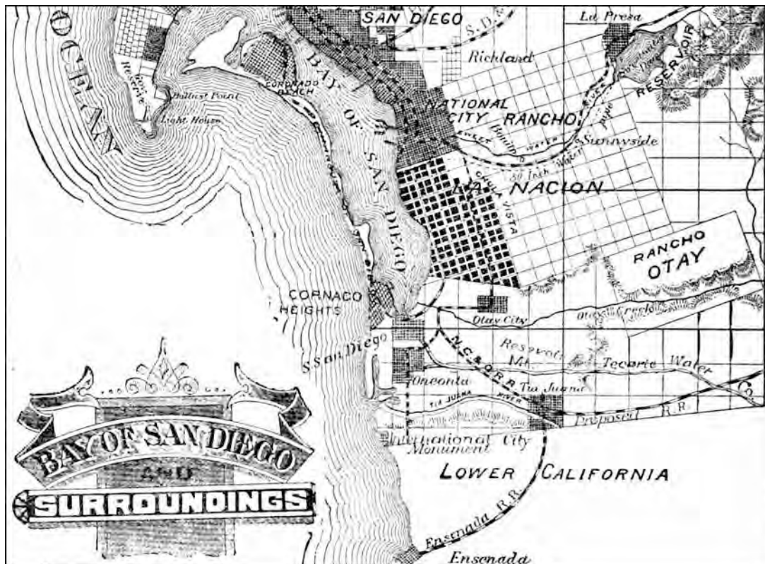
Map of the South Bay region from The Great Southwest magazine, May 1891.

6 - The Tijuana Slough is the salt marsh at the mouth of the Tijuana River. It is at the end of a river 120 miles long with a watershed of 1750 square miles, most of which lies in Mexico. The final 6 miles of river north of the border has changed course several times due to flooding, especially in 1895, 1916, 1927, 1980 and 1993. The