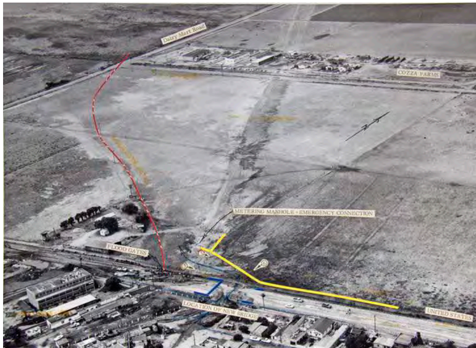
Old Dairy Mart Road in the center of this photo ended at Gate No. 2. The Cozza Farm is shown near the top and the Hofer Dairy is shown at the location of the flood gates, bottom left (Oct. 11, 1966,).