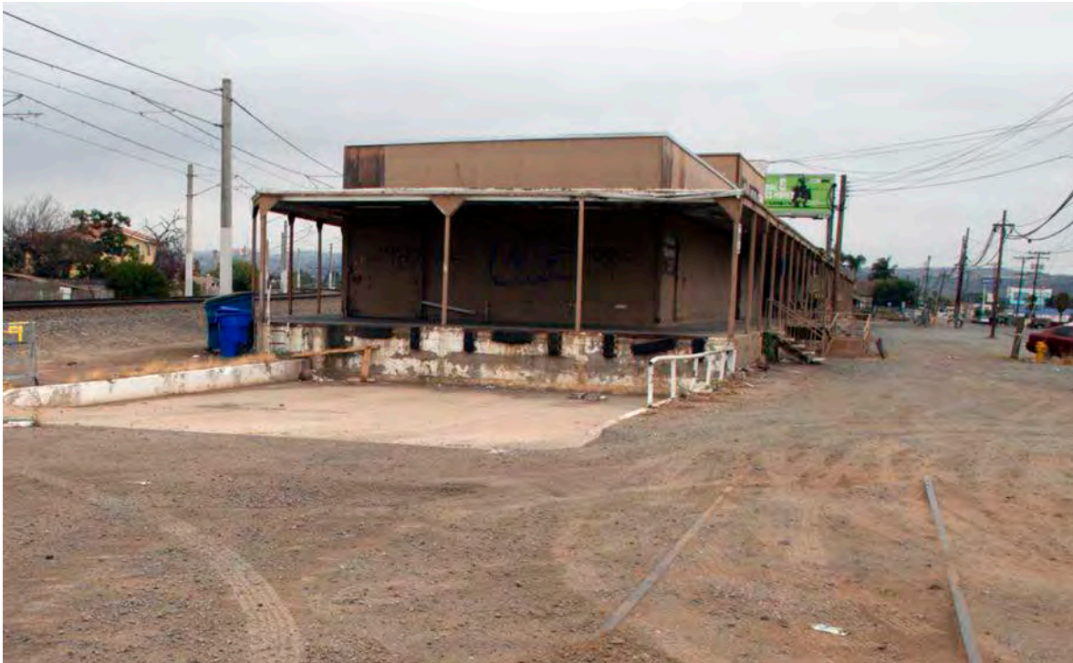
The Egger-Ghio Golden West Packing Co. was next to the tracks in Palm City.