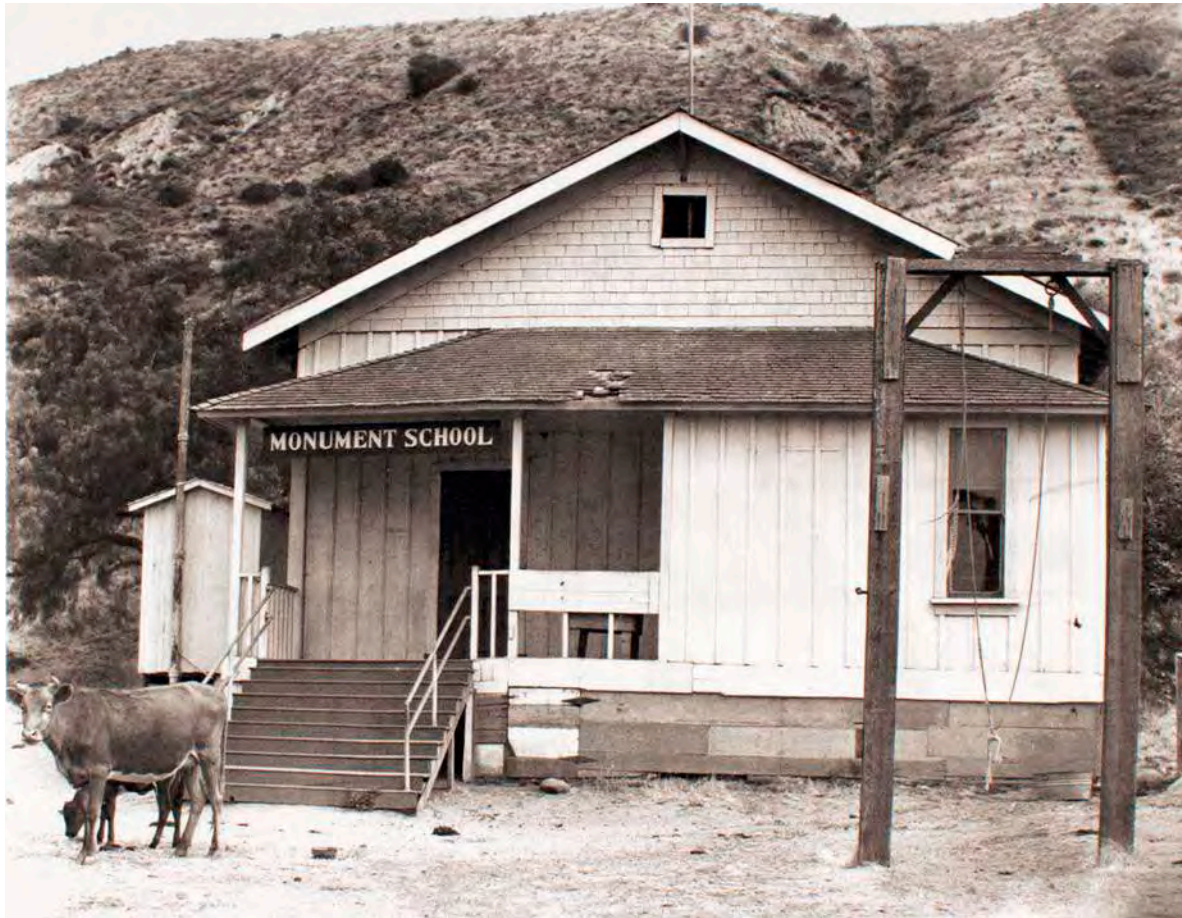
Monument School was the oldest school in the county when this photo was taken in 1938.