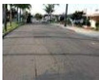
PCI = 68