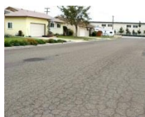
PCI = 21