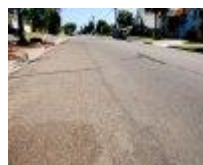
PCI = 75