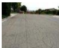
PCI = 40