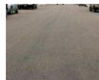
PCI = 95