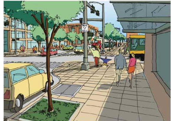
Landscape/Furniture Zone Pedestrian Zone Frontage Zone