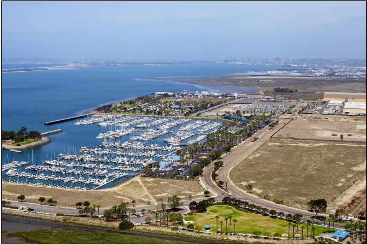
Figure 2: View of Chula Vista Bayfront Looking Northwest

Once completed, the public will enjoy more than 200 acres of parks, a shoreline promenade, walking trails, RV camping, shopping, dining and more. Preliminary site preparation is already underway with the construction of access roads, new public streets and other infrastructure to be underway in 2019. Construction of the resort and convention center is expected to be complete by 2023.