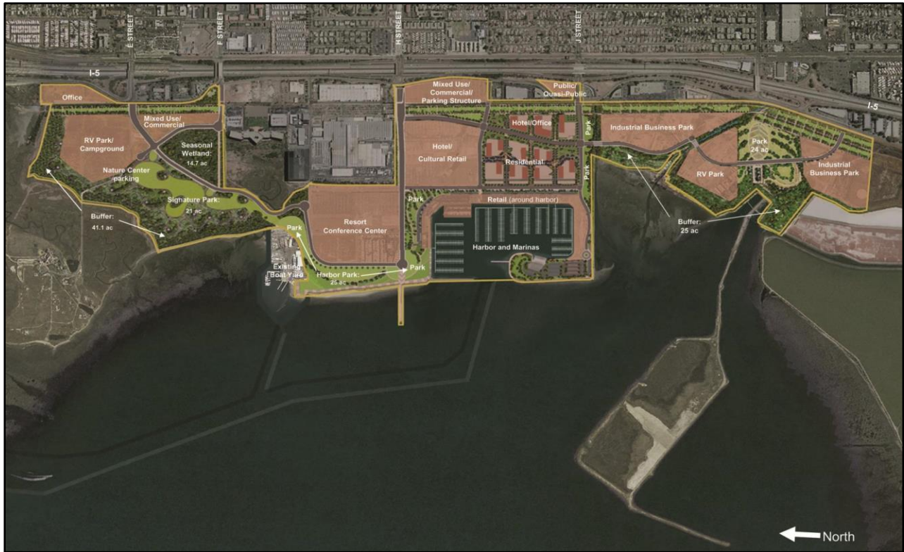
Figure 1: Chula Vista Bayfront Master Plan (Site Plan)

Approximately 230 acres (more than 40%) of the project's total acreage is dedicated to parks, open space and habitat restoration/preservation; with 130 acres identified for new parks and open space. These areas will include promenades, bike and hiking trails and other public access areas linking the entire Bayfront. See Figure 2 for a photograph of the Chula Vista Bayfront looking northwest toward downtown San Diego.