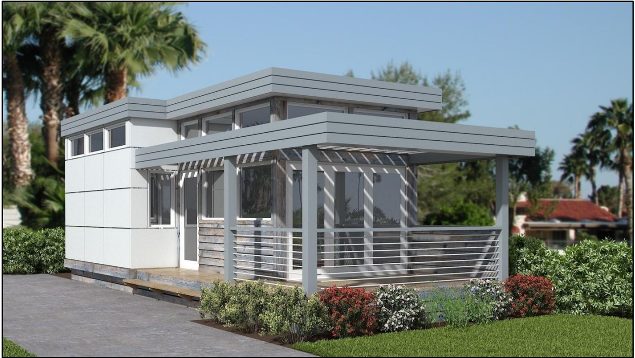
Figure 4: Visual Rendering of the Costa Vista RV Resort

Additional amenities include aquatic features including a children's play pool, family pool and Jacuzzi; day spa/salon, massage treatment rooms, sauna and work-out gym; grill/restaurant; entertainment arcade, game room; business center and a multi-purpose room for educational and large guest gathering. A covered picnic area with outdoor grills; children's rock climbing and playground, bocce ball courts and horseshoe pits; protected dog area; and welcome center with a marketplace, restrooms, showers and guest laundry facilities.