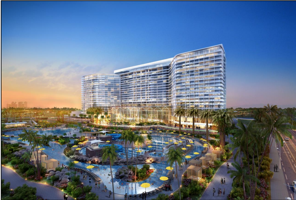
Figure 3: Visual Rendering of the Resort and Convention Center

Phase I implementation of the Chula Vista Bayfront Master Plan includes construction of the resort and convention center, as well as the creation of public parks and open space, the restoration of habitat areas and the construction of a new fire station, a new 1,600 stall parking structure and mixed-used development.