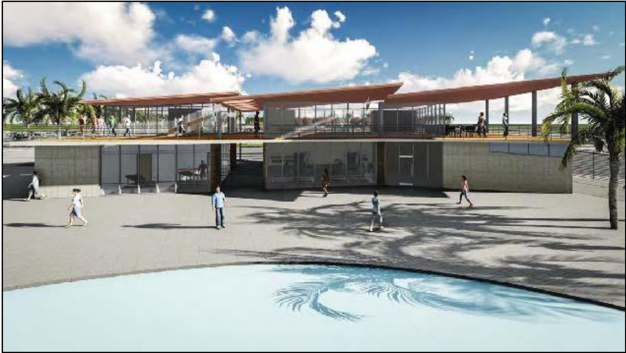
Figure 5: Visual Rendering of the Costa Vista RV Resort

Additional offsite improvements such as relocating and building new roads, new sidewalks and new utilities will also be included as part of the project.