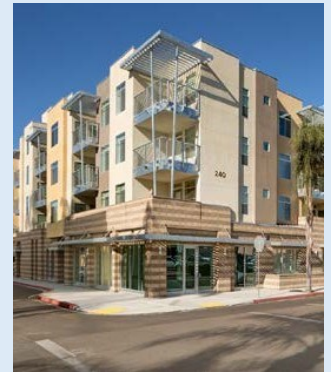
Lofts On Landis