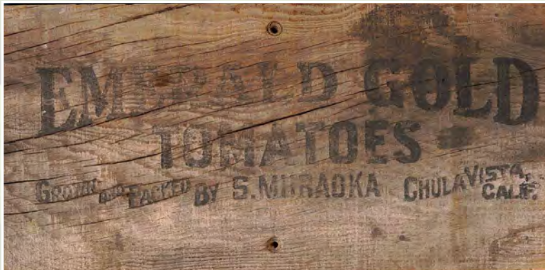
Saburo Muraoka sold celery and other vegetables using the "Emerald Gold" label. Wooden vegetable "lug" boxes—with his label burned into them—were used to ship the vegetables to market.

Like the Muraokas, most of the Japanese immigrants were hard-working and law-abiding citizens of California. Still some people didn't like the Japanese who had settled in the U.S. When the country of Japan attacked Pearl Harbor on Dec. 7, 1941, and the U.S. entered