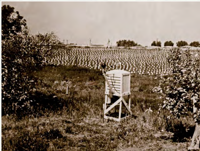
Celery “tents” were first used by Japanese farmers in Chula Vista and eventually were used on farms all across Southern California.

Besides introducing several new crops in Chula Vista, the Muraokas started the use of small tents originally made of used newspaper. These “tents” protected the celery and cucumber plants from harsh weather when the small seedlings were just planted in the