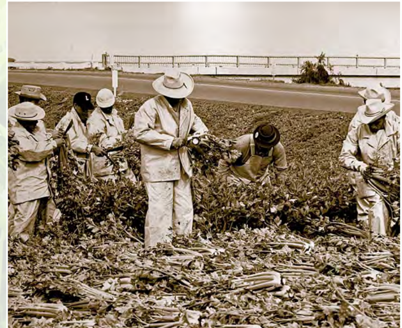
After celery was picked in Chula Vista it was boxed and sent to markets across the U.S.