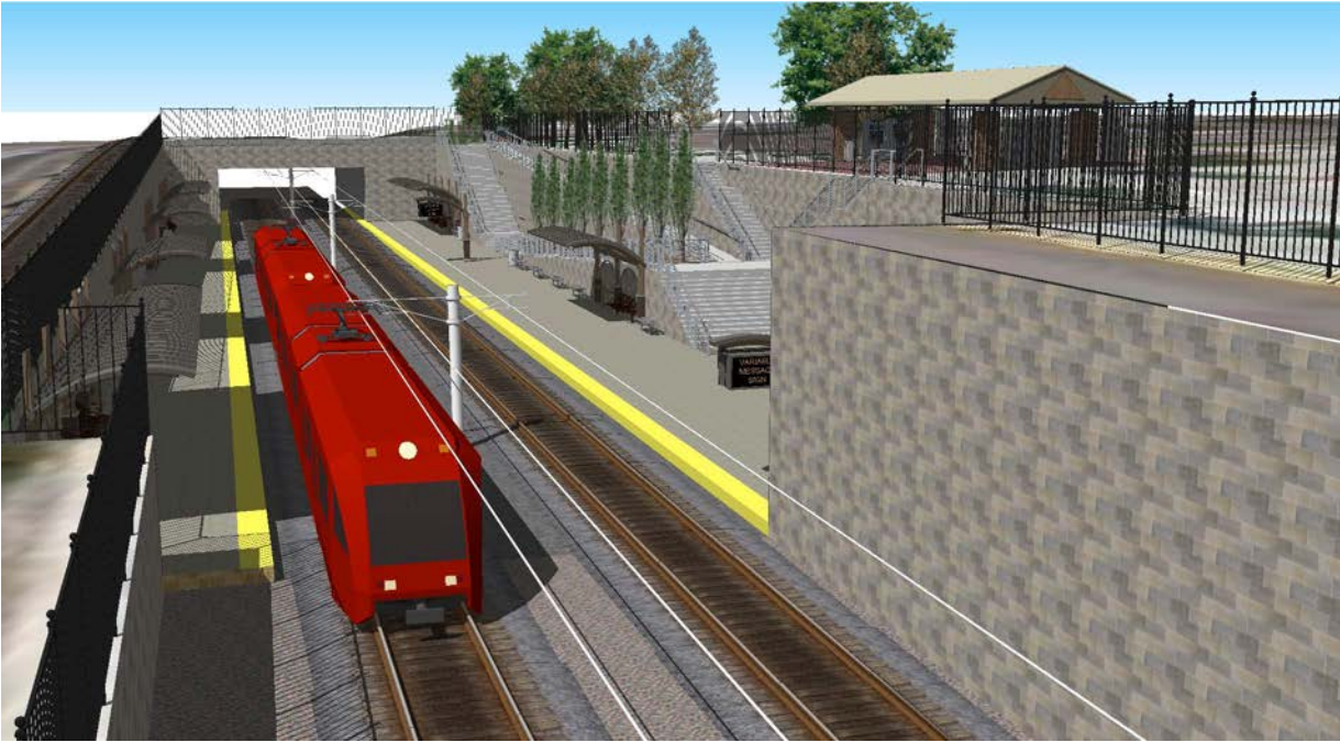
Alternative E4: Below Grade Station View From South