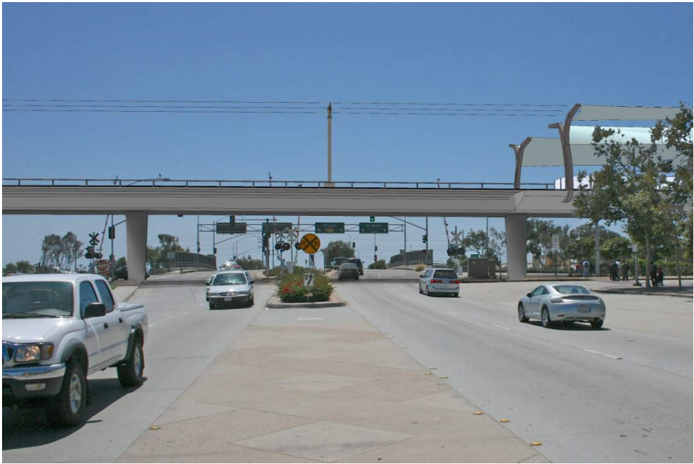
Alternative H2: Aerial Station Over Existing View From H Street