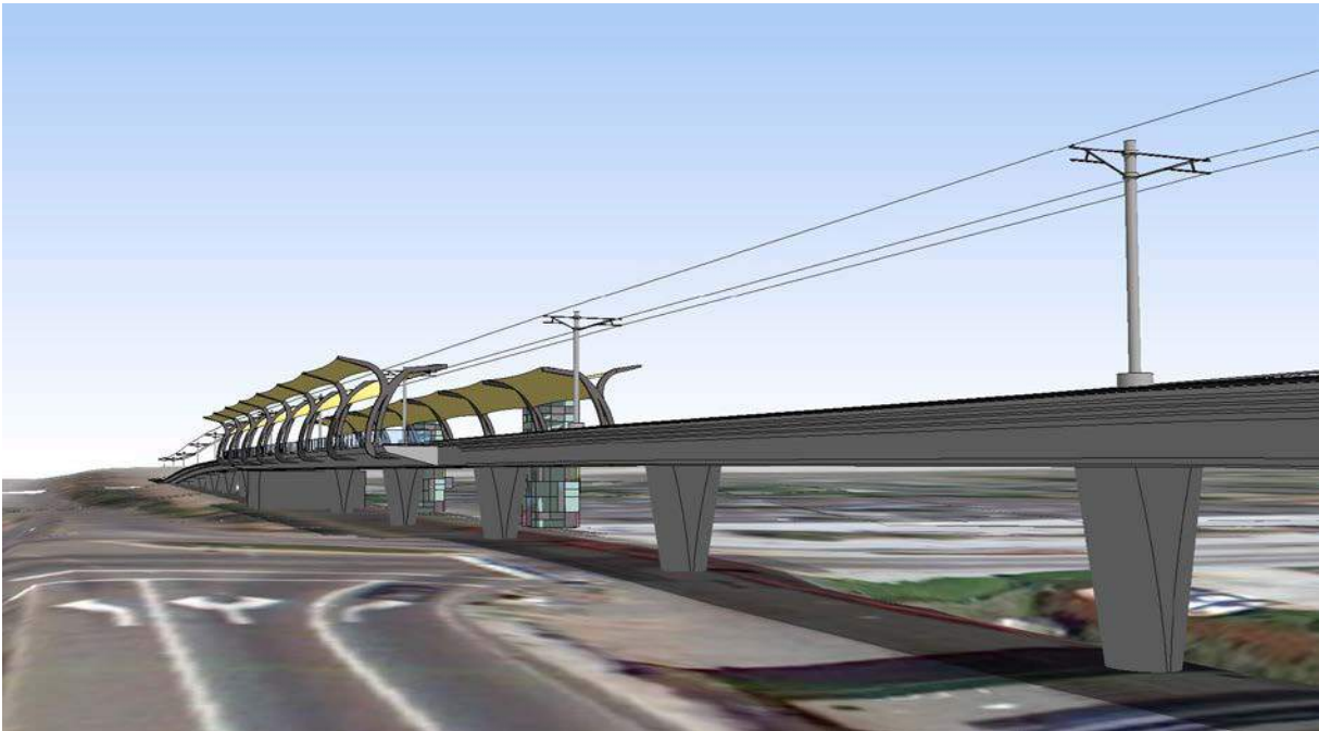
Alternative H2: Aerial Station Over Existing View From Southwest