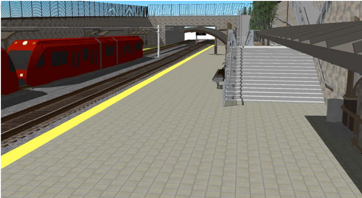
Alternative E4: Below Grade Station View From Platform