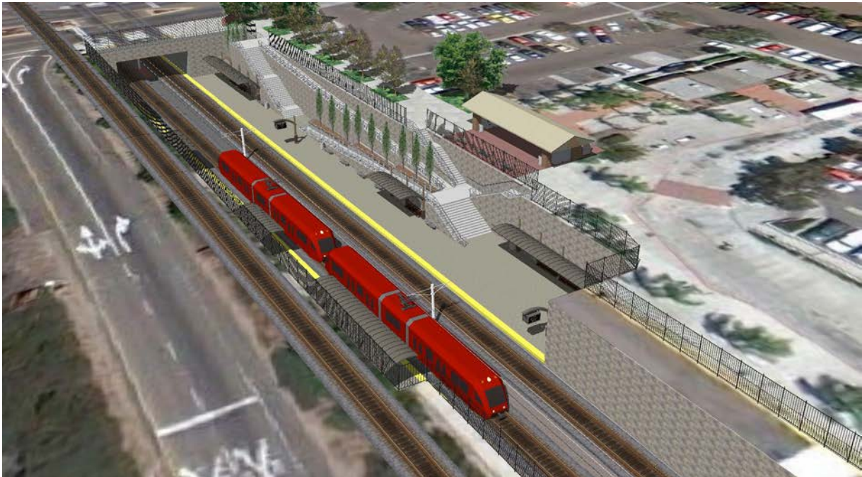
Alternative E4: Below Grade Station Oblique View From Southwest