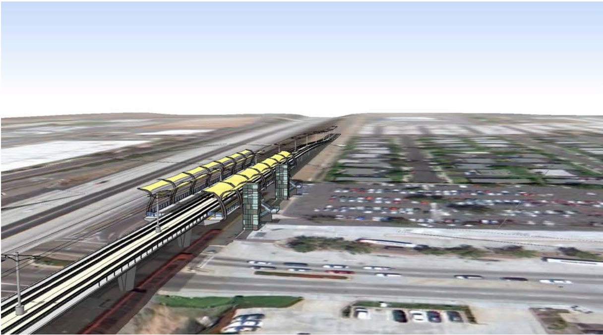
Alternative H2: Aerial Station Over Existing Oblique View From Southeast