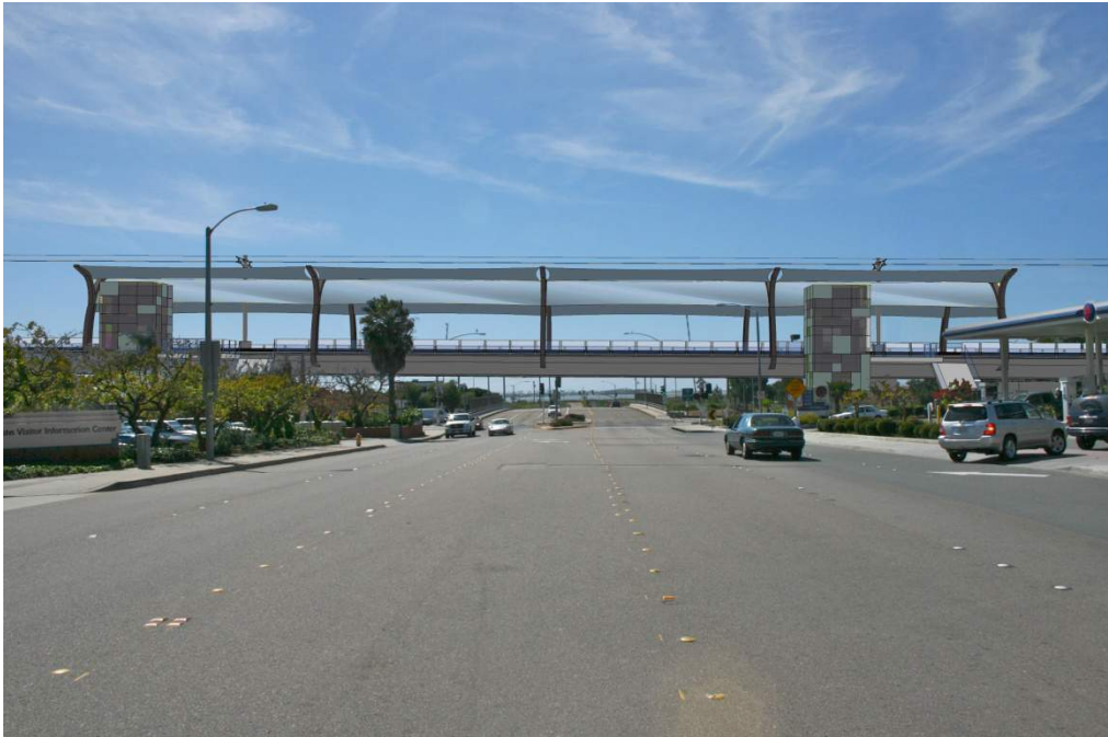
Alternative E1: Aerial Station Over E Street Looking West