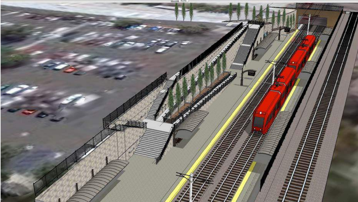
Alternative H4: Below Grade Station Oblique From Northwest