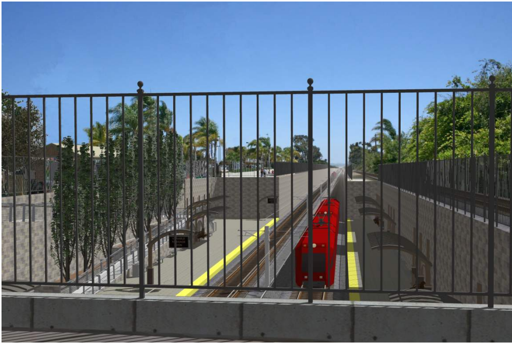
Alternative E4: Below Grade Station Looking South From E Street