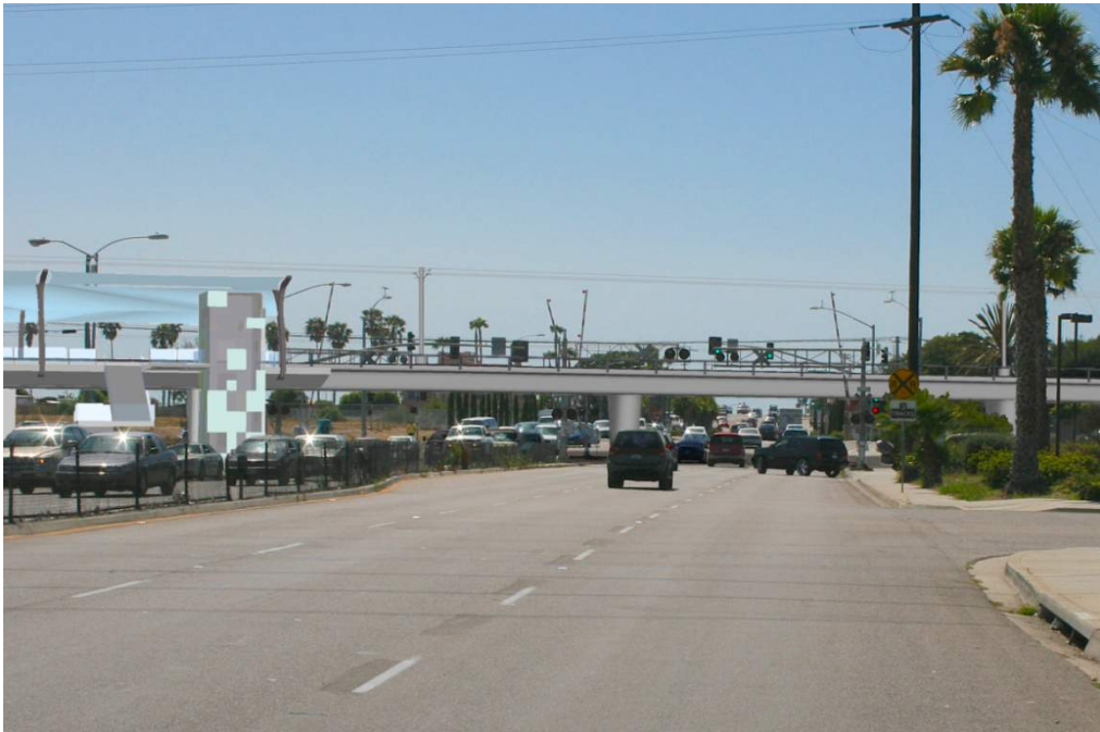
Alternative P2: Aerial Station Over Existing Station From East