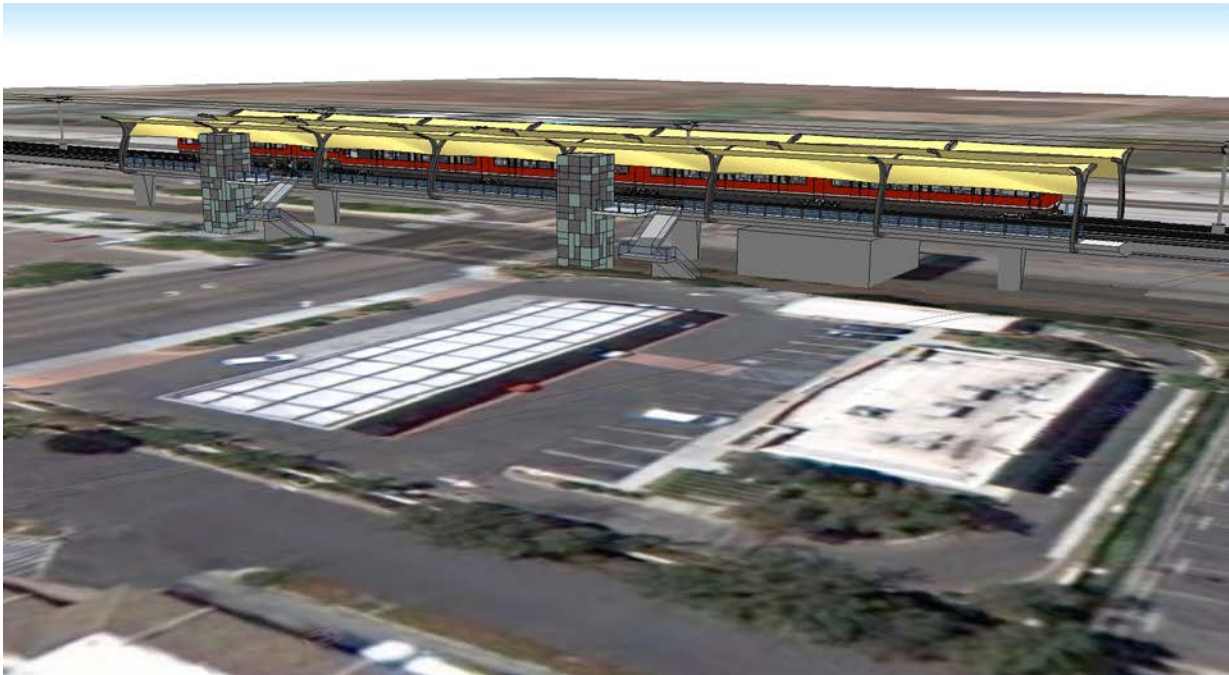
Alternative E1: Aerial Station Over E Street Oblique View From Northeast