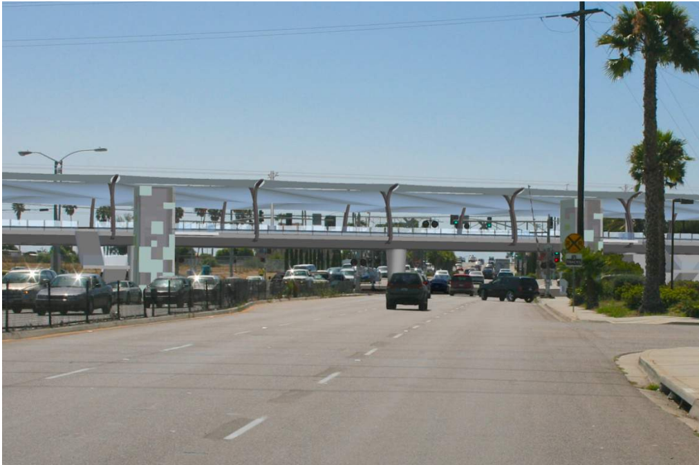
Alternative P1: Aerial Station Over Palomar Street From East