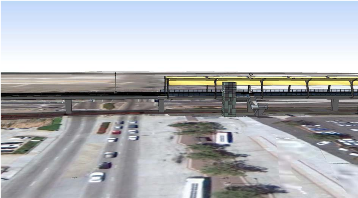
Alternative H2: Aerial Station Over Existing View From East