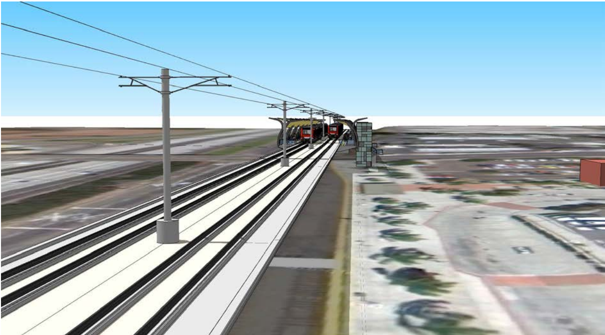
Alternative E1: Aerial Station Over E Street Looking North