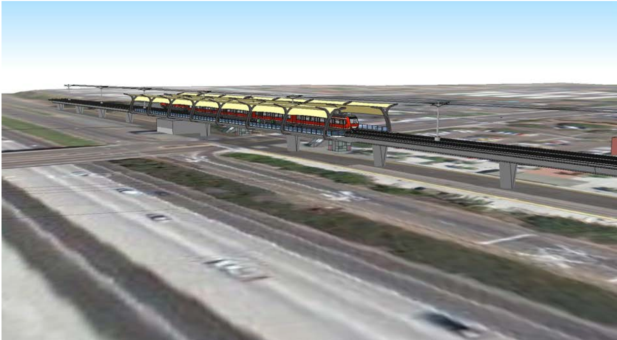
Alternative E1: Aerial Station Over E Street Oblique View From Southwest